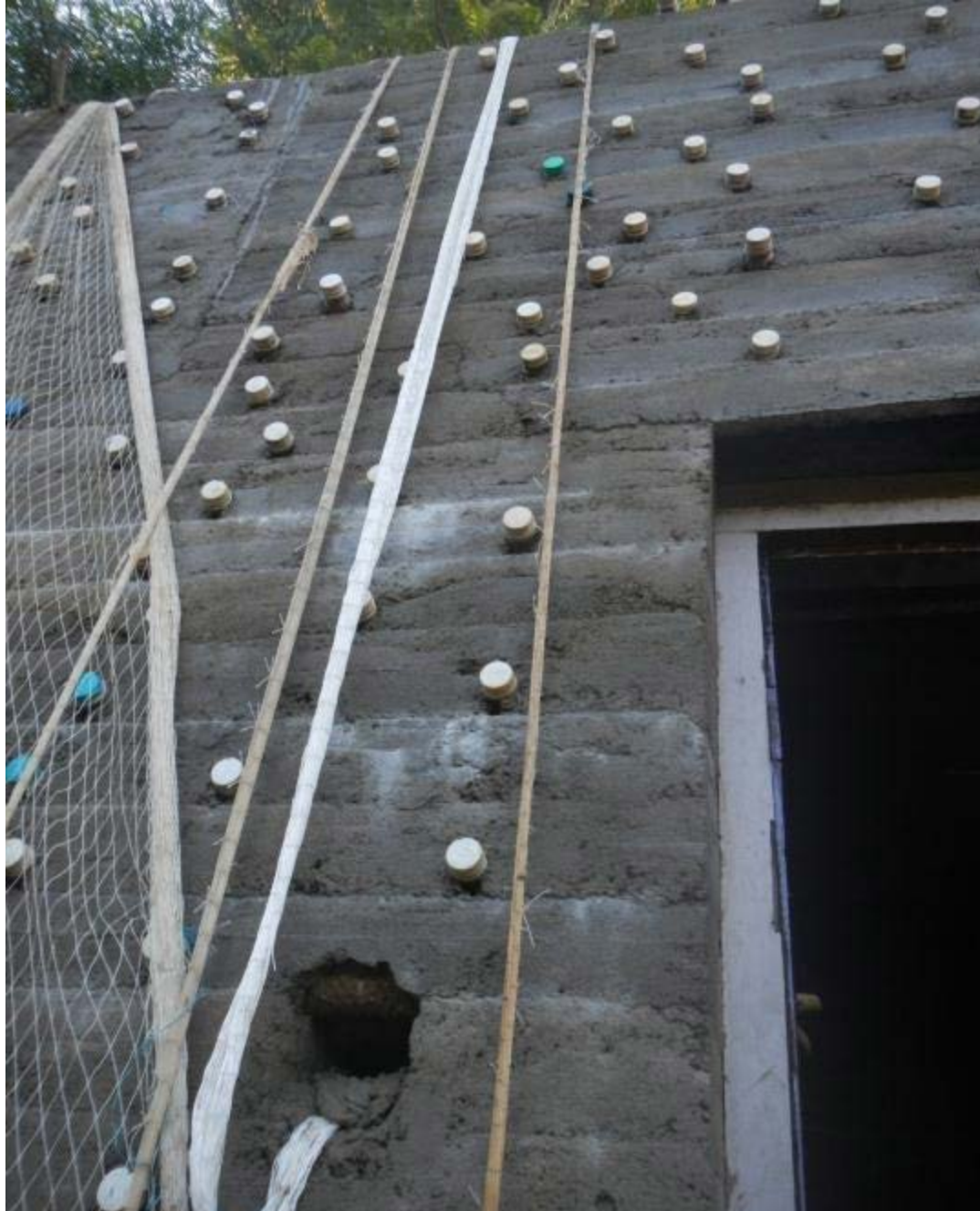
TIGHTENING OF NET AND FISH NET ROPES