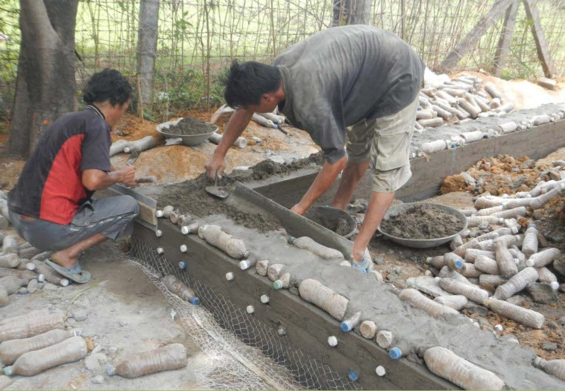
THE WALL EMERGING(NOTE :BOTTLE CAPS ARE VISIBLE)