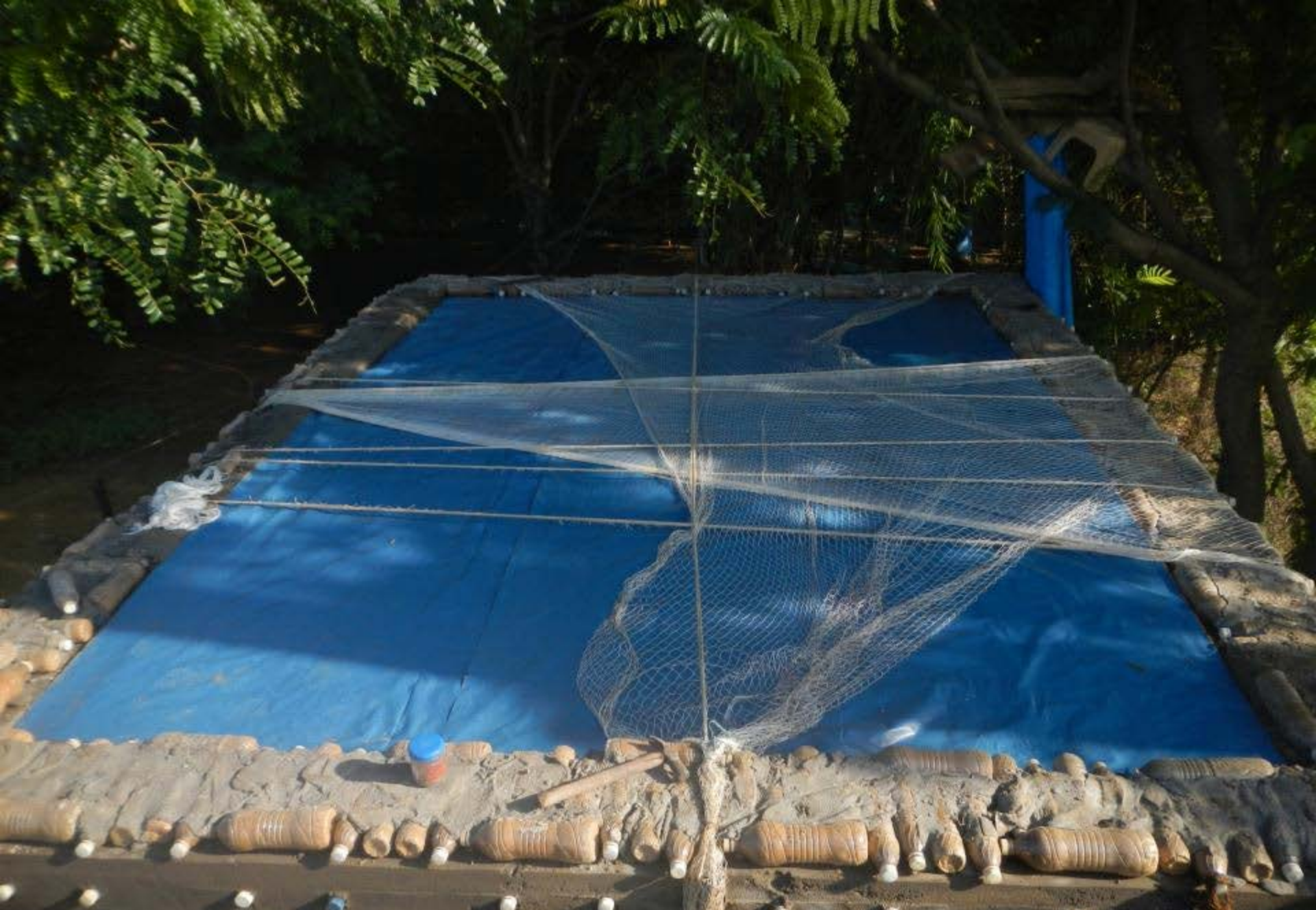
LAYING OF NET AND ROPES FOR CONCRETE SLAB