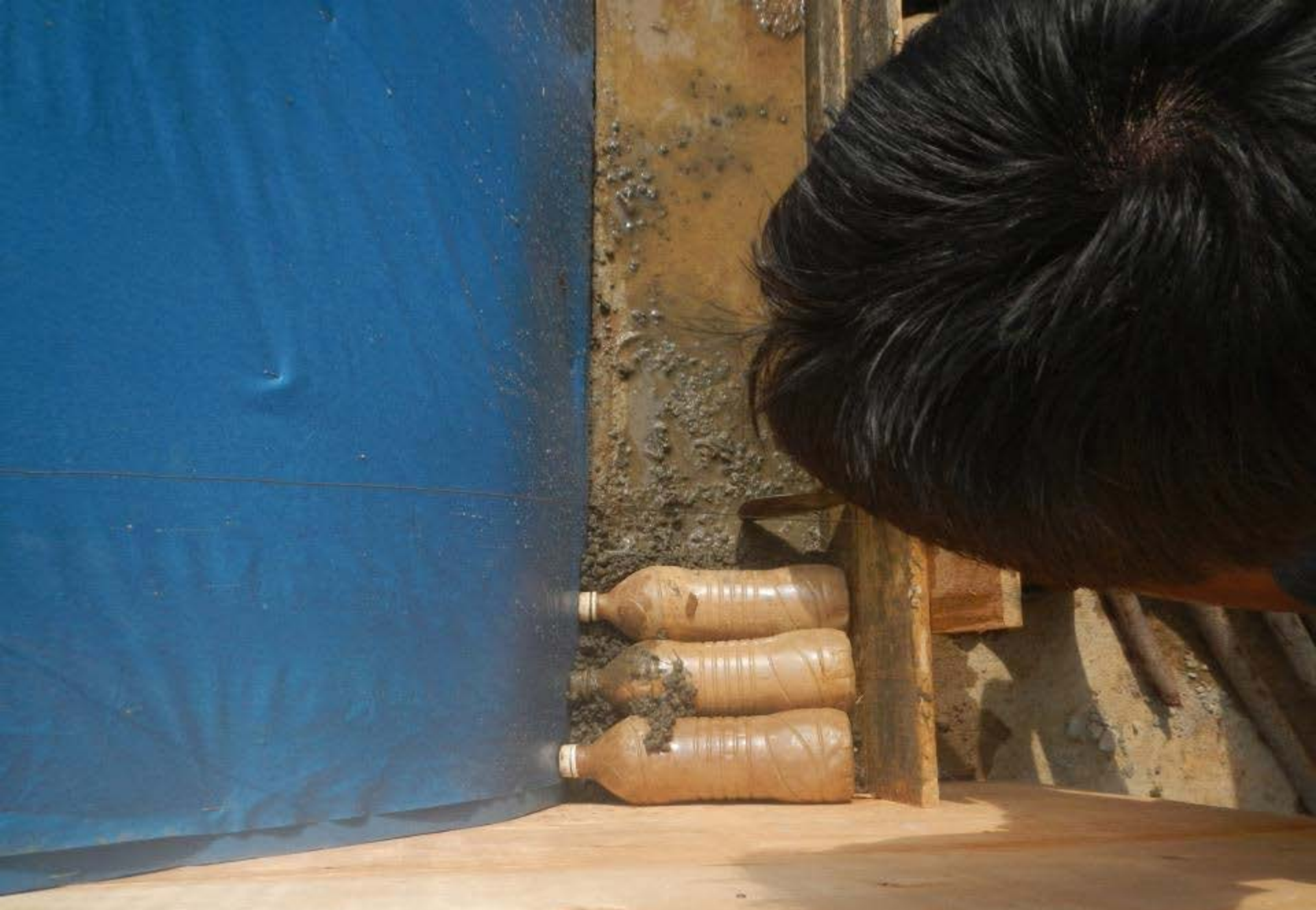
PLACEMENT OF BOTTLES FOR DOME