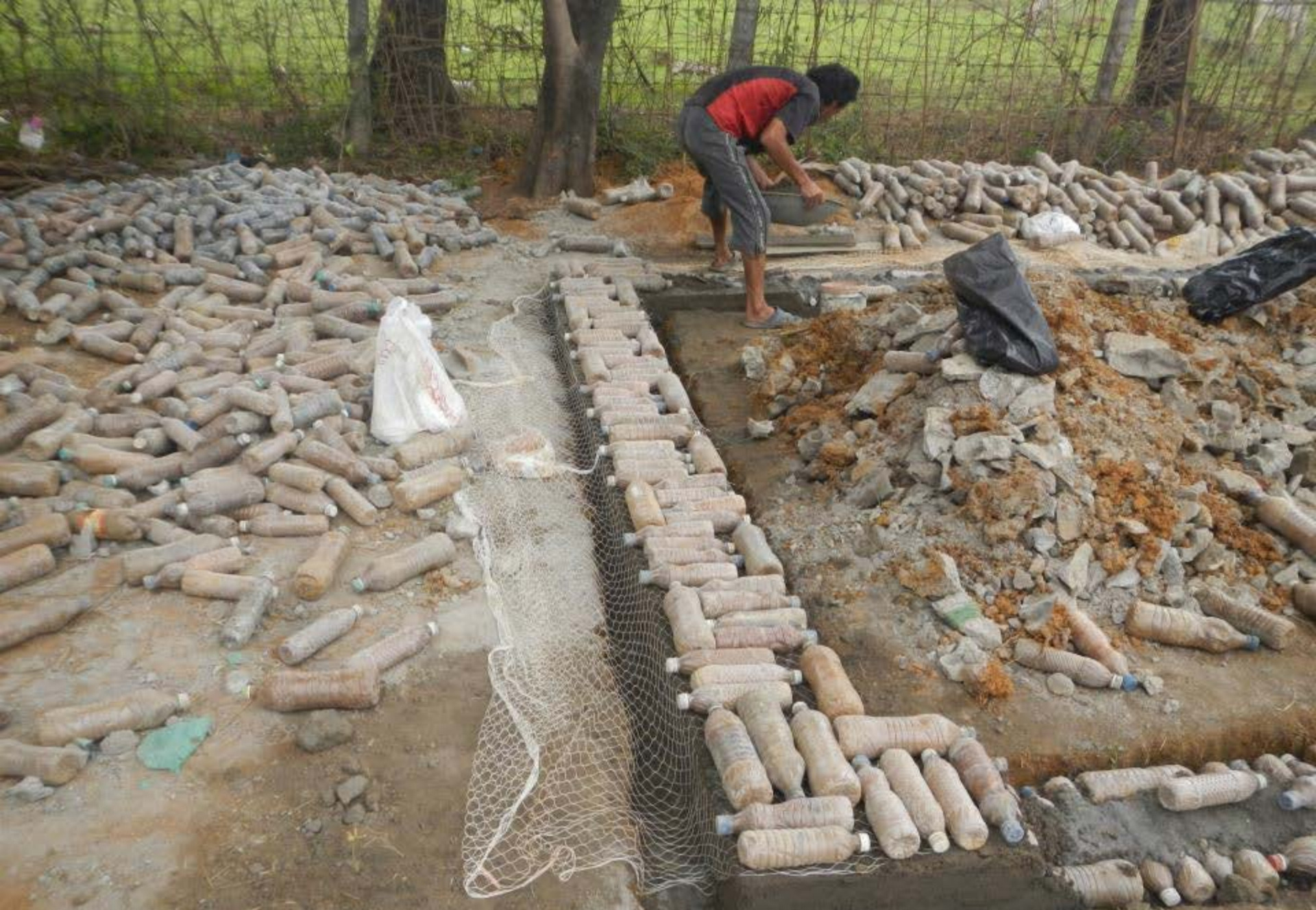
HANDLING OF FISH NET