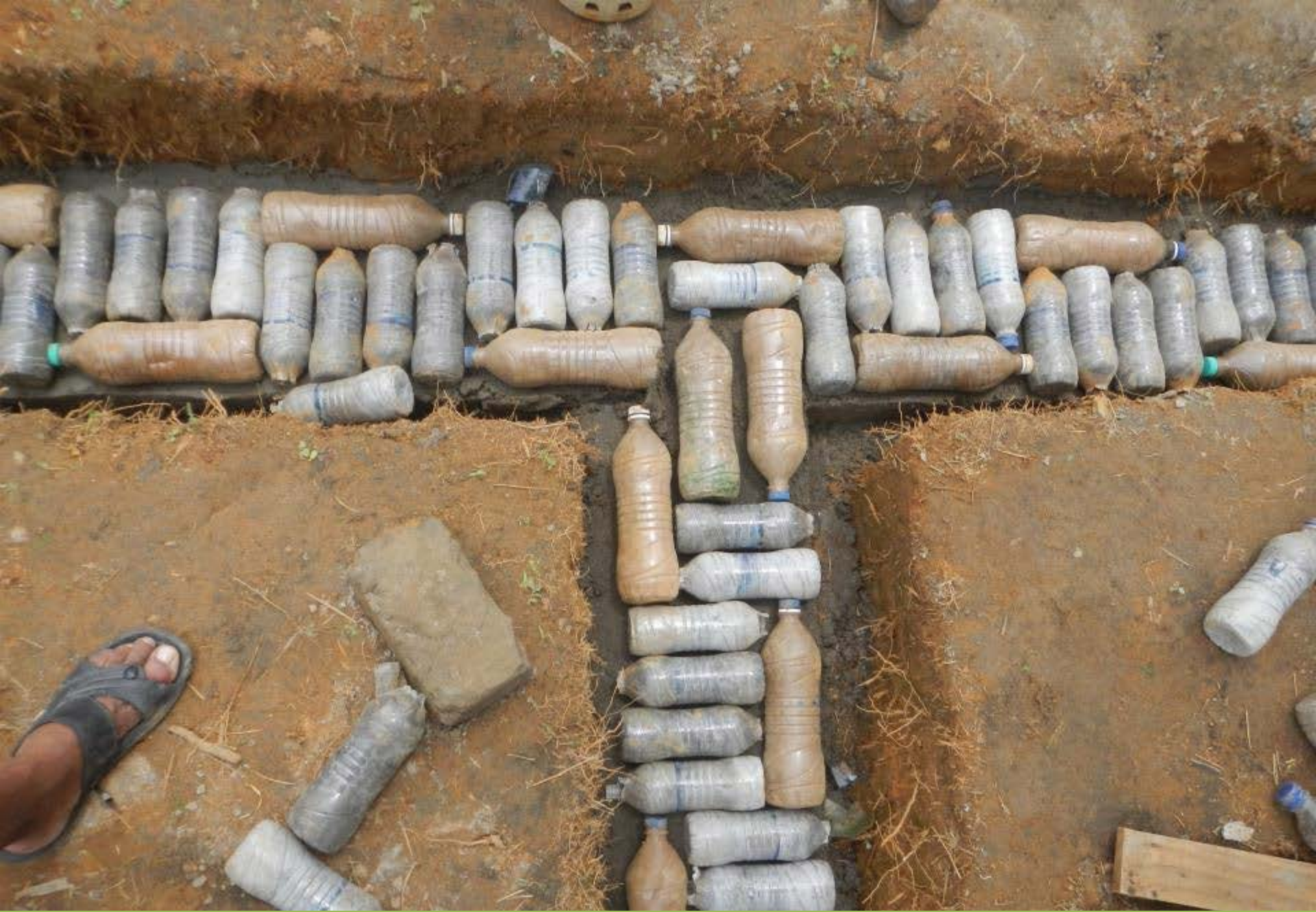
BOTTLE PLACEMENT AT 'T' JOINT