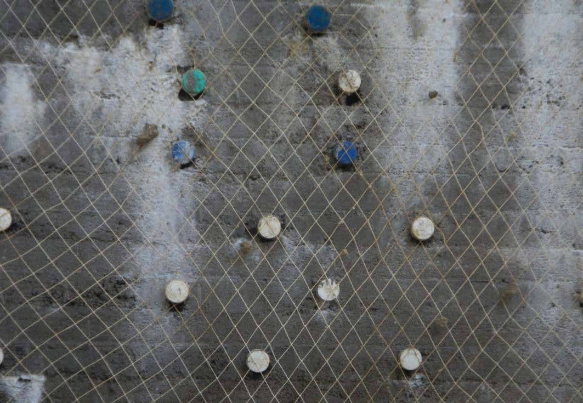
CLOSE UP OF FINISHED WALL