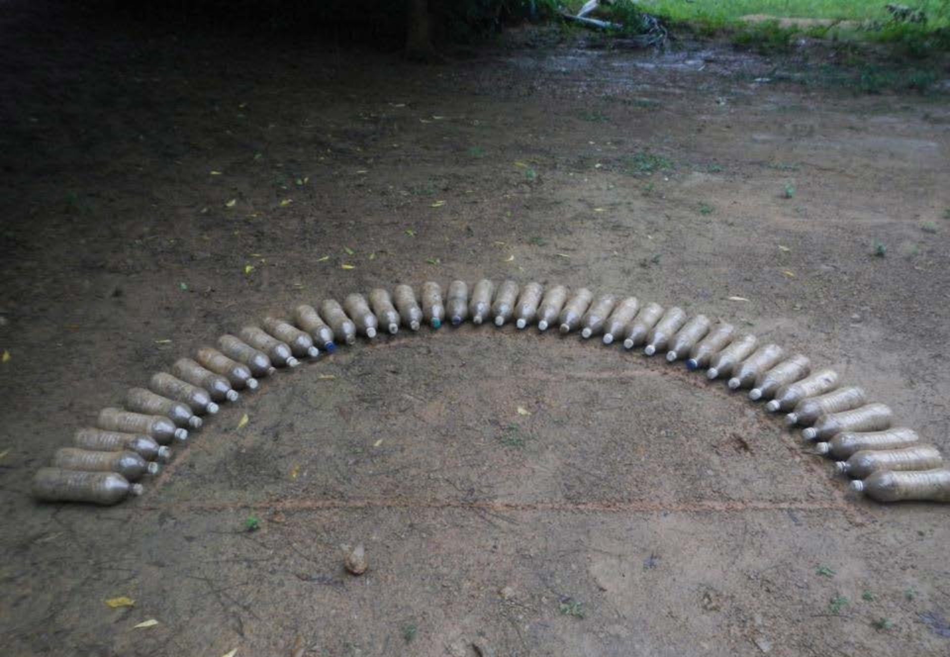
TRIAL PLACING OF BOTTLES TO FORM ARCH FOR DOME