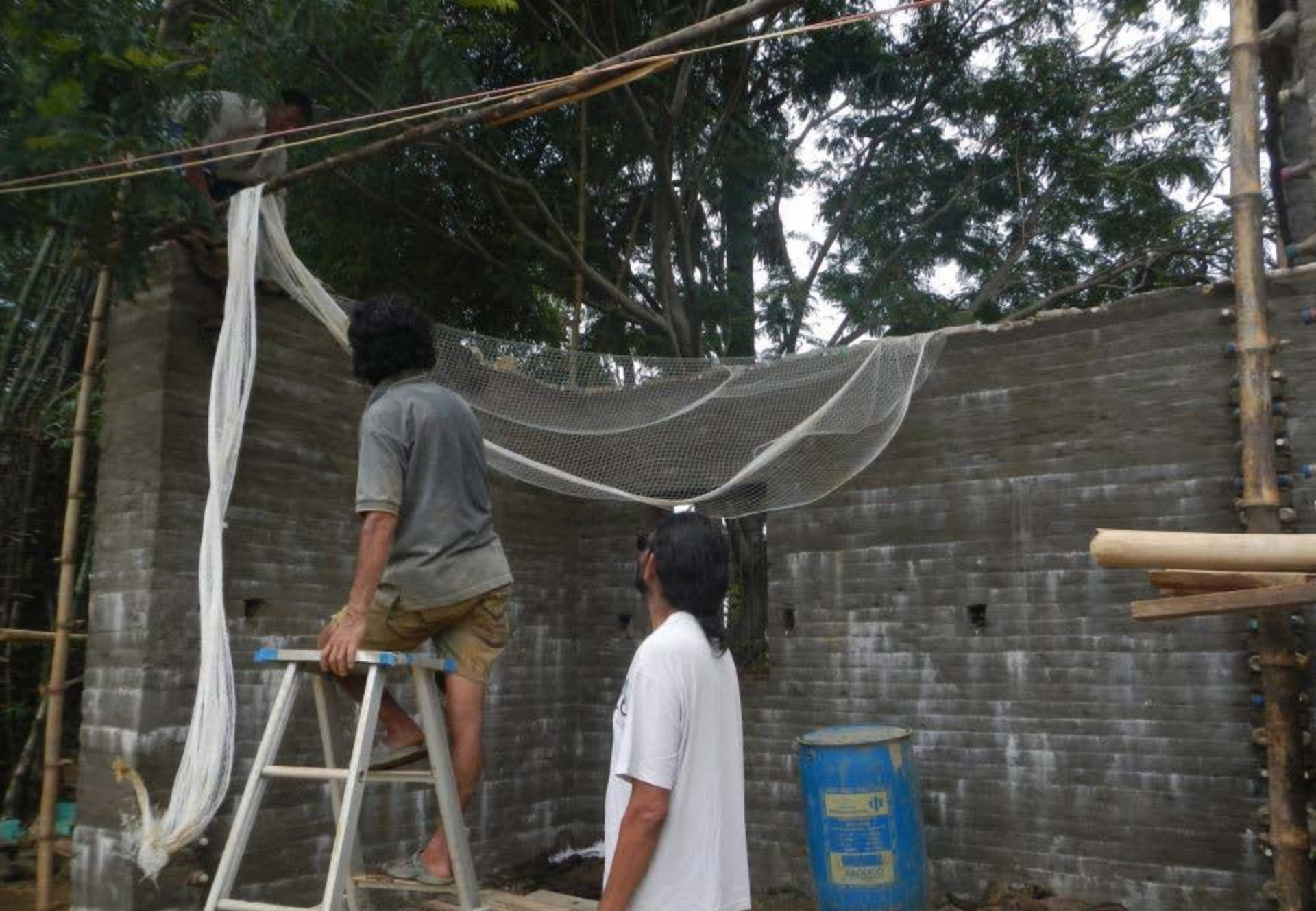
LOOPING OF FISH NET TO OPPOSITE WALL