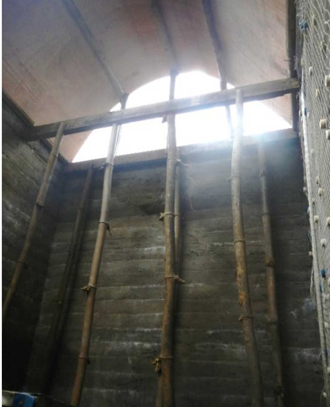
SHUTTERING FOR DOME ROOF