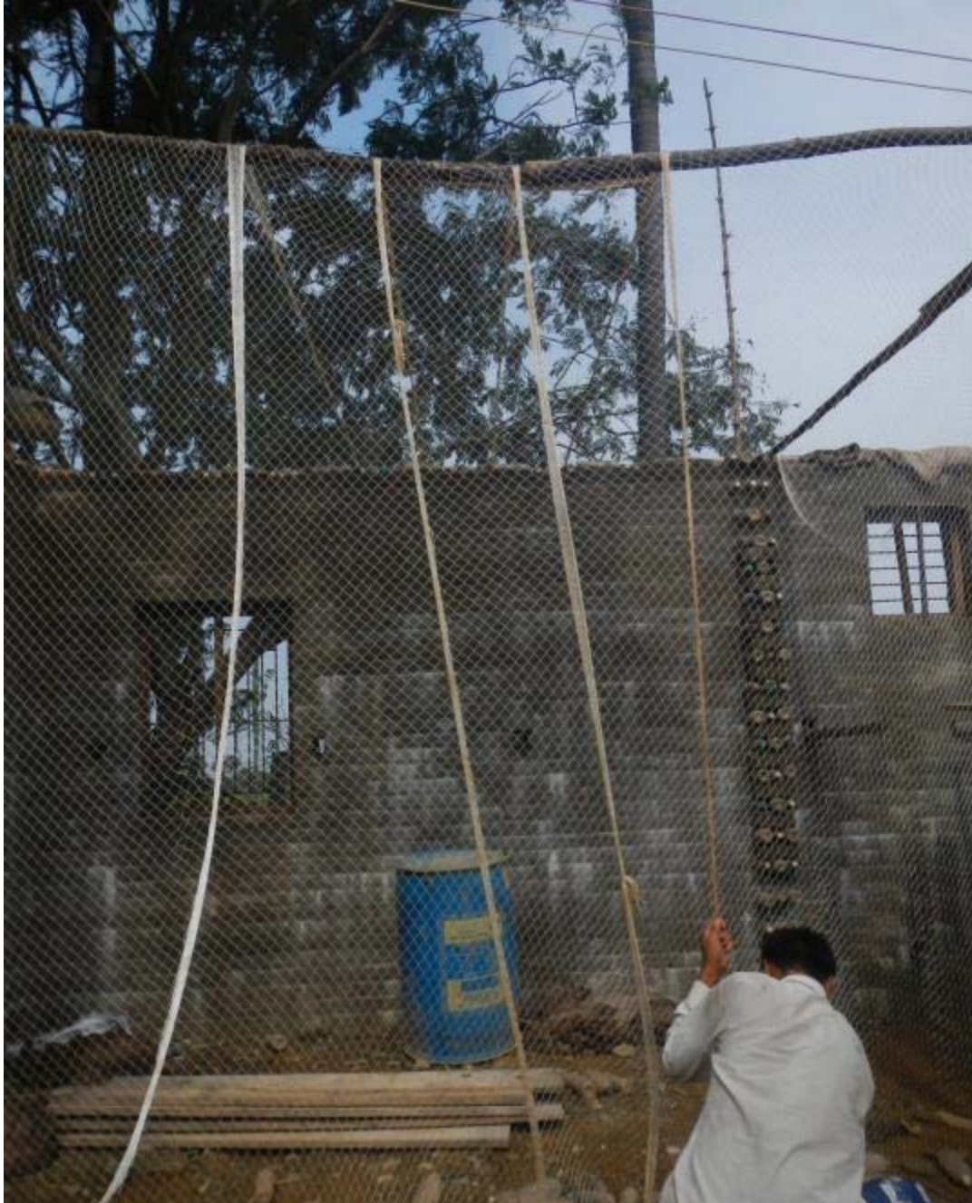
TIGHTENING OF FISH NET (NOTE : TWISTED ROPES OF FISH NET FOR ADDED STRENGTH)