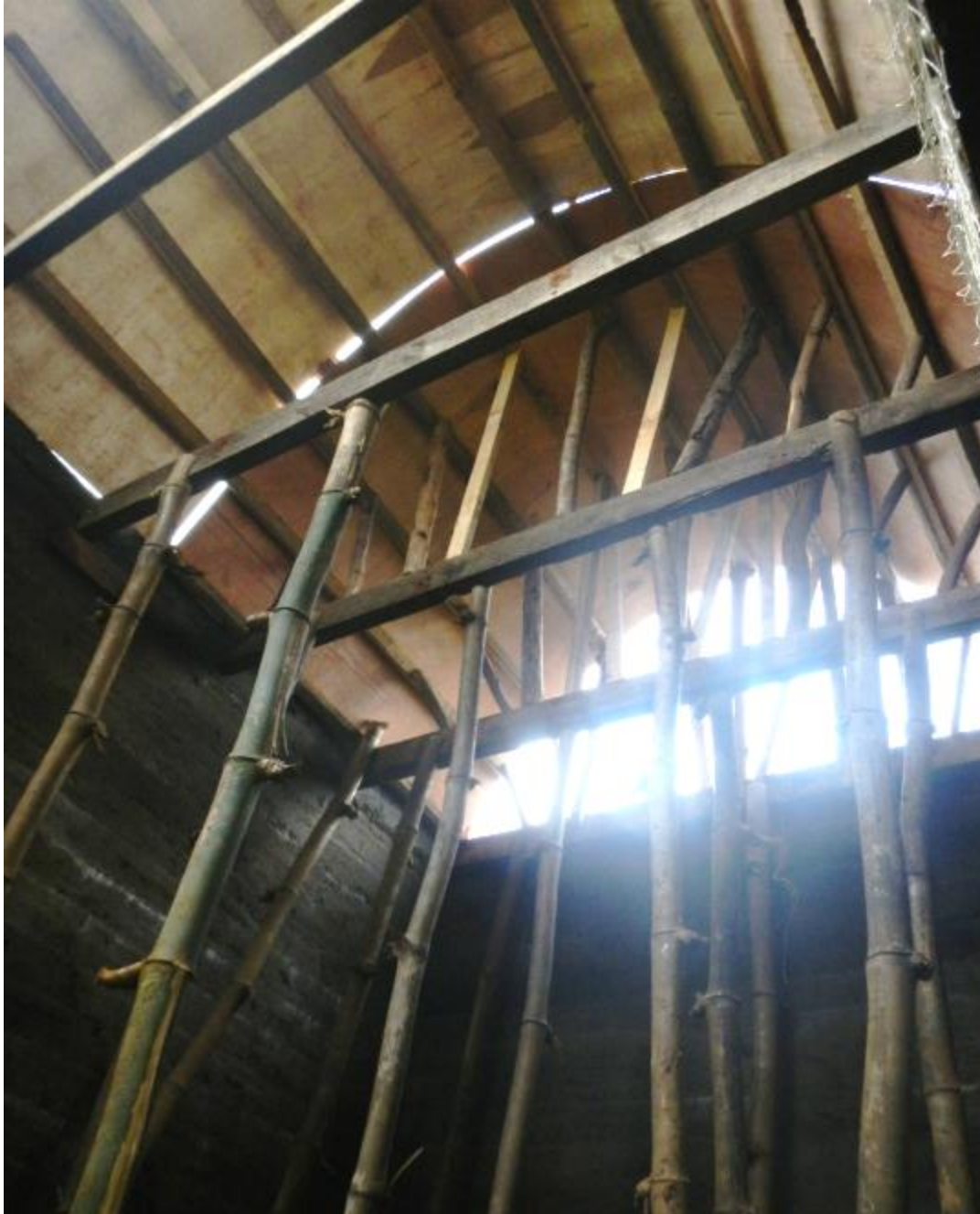
SHUTTERING FOR DOME ROOF