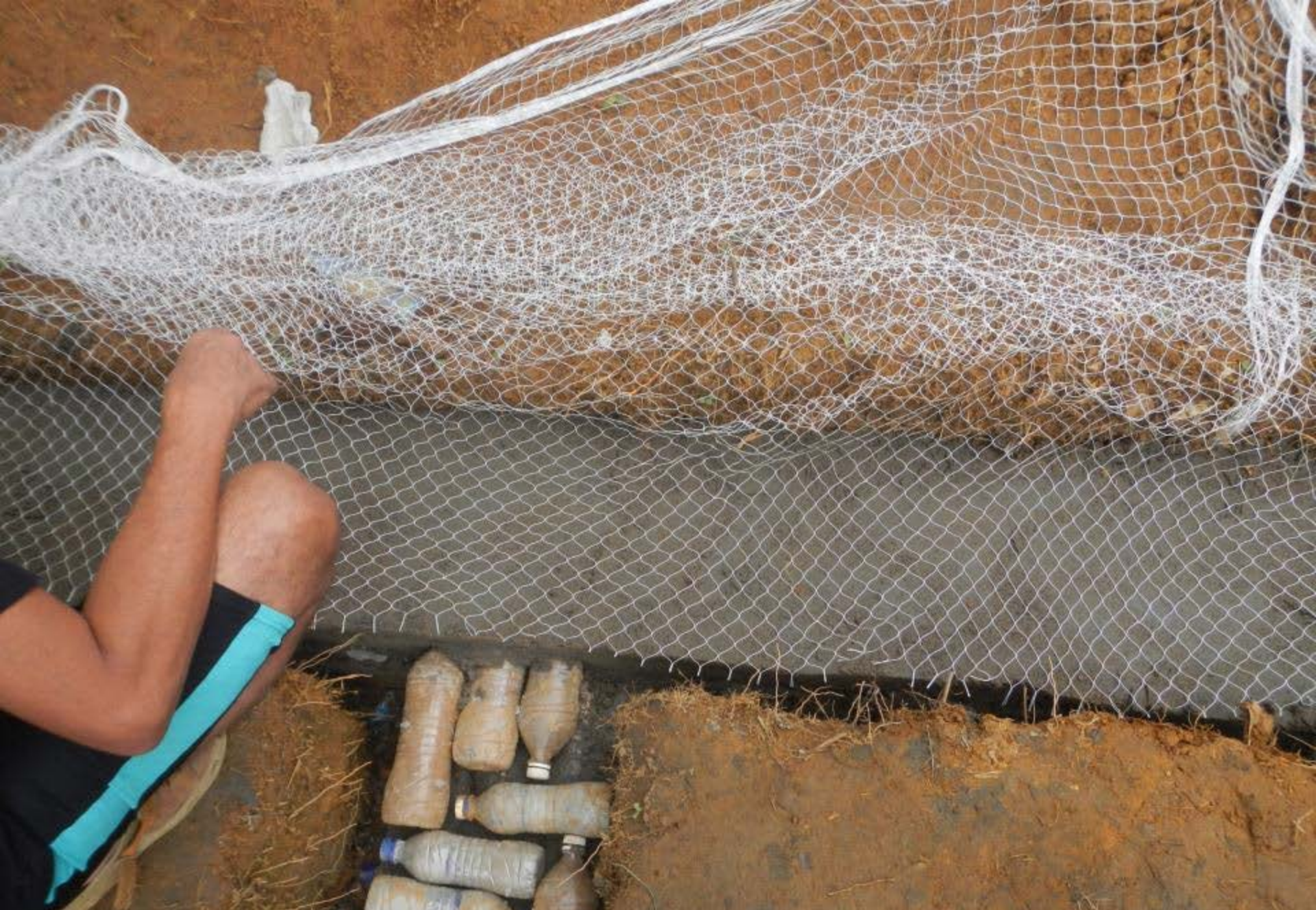
MERGING OF THE FISH NET WITH THE FOUNDATION