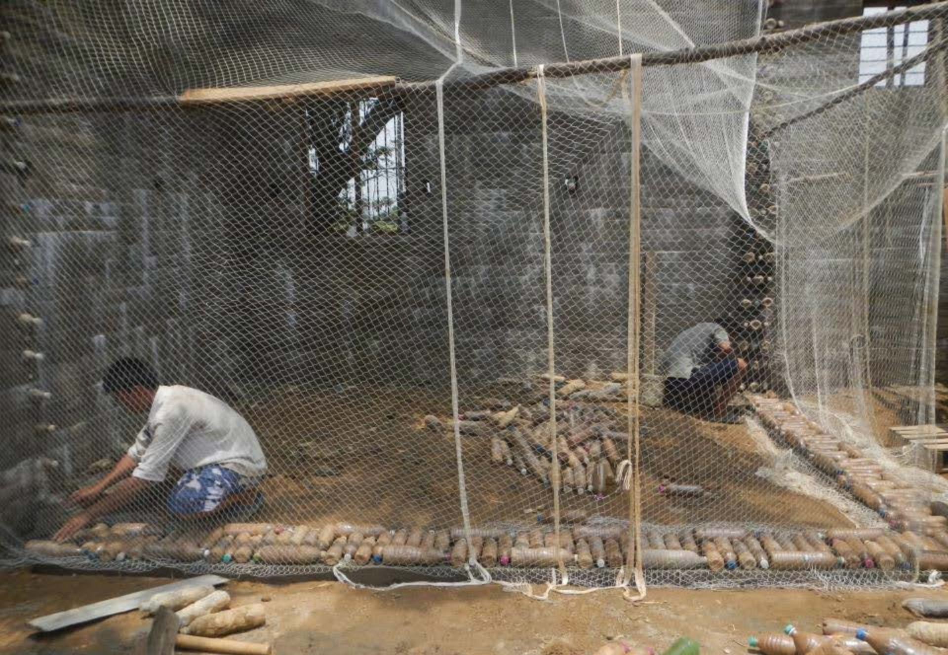
MERGING OF FISH NET WITH OPPOSITE WALL