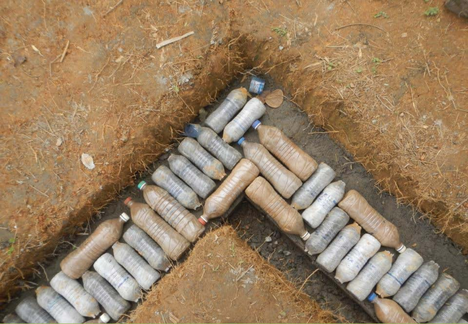
BOTTLE PLACEMENT AT 'L' JOINT