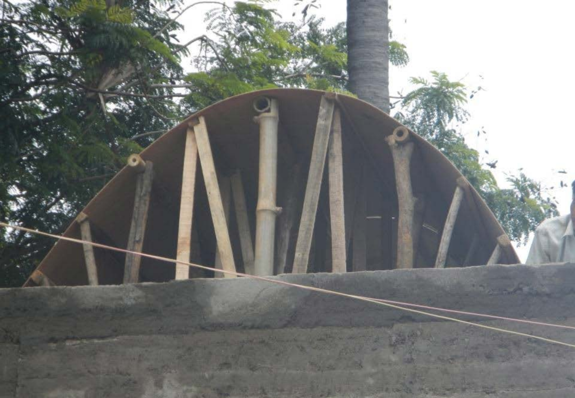
SHUTTERING FOR DOME ROOF –CLOSE UP