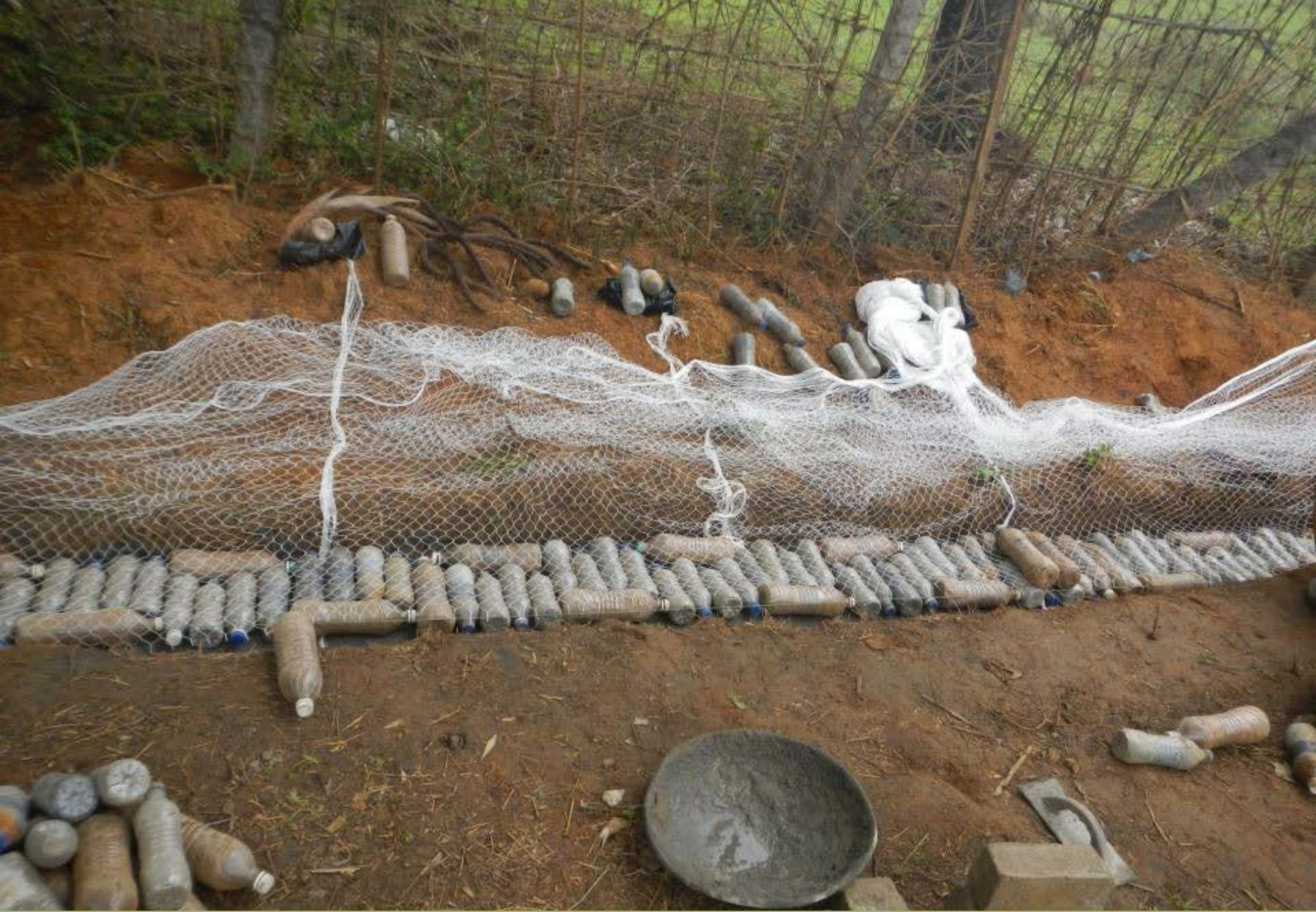
LAYING NYLON 6 FISH NET (3cmx3cm)